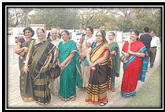
Retired teachers of Dept. of Chemistry with some of the present teachers