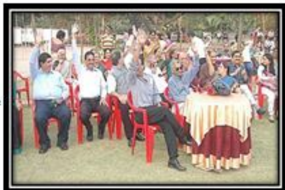
Participation in a game