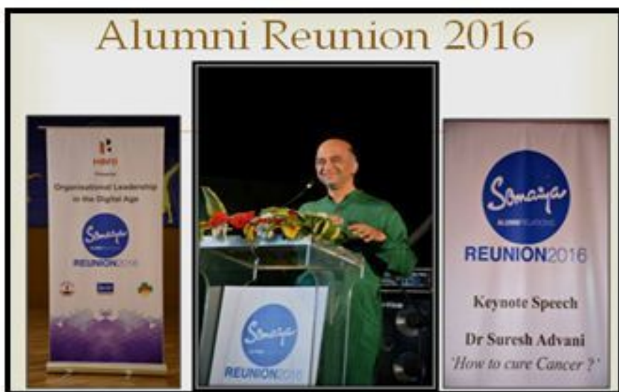
President of Somaia Vidyavihar addressing the gathering

Stall of KJSSC proudly displaying NCC girls battalion achievements